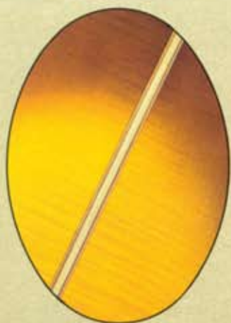
Brown Sunburst Finish