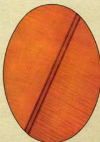
Antique Violin Finish